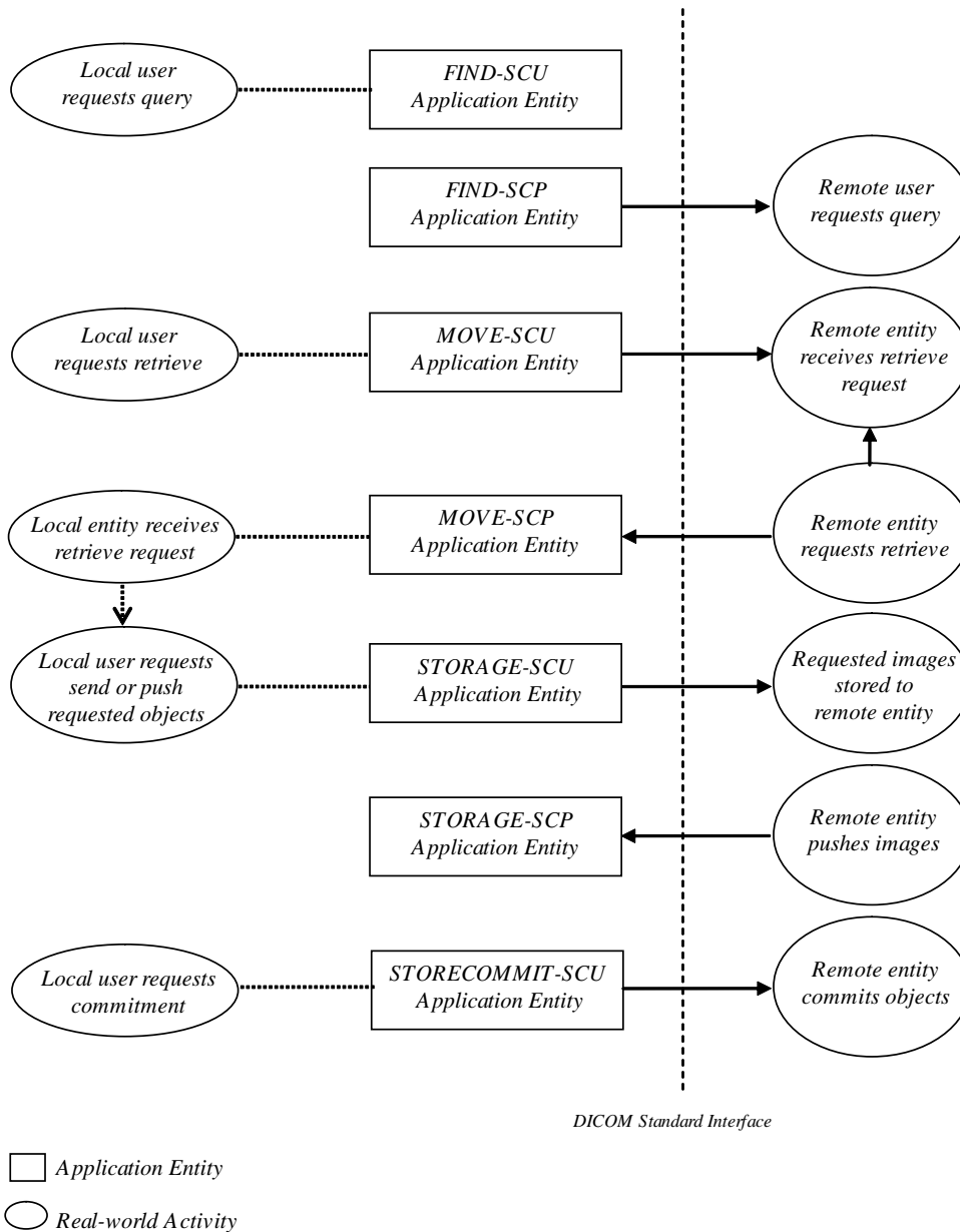
Figure 3-2 Implementation Model

The implementation consists of a set of applications which provide a user interface, internal database and network listeners that spawn additional threads or processes as necessary to handle incoming connections.